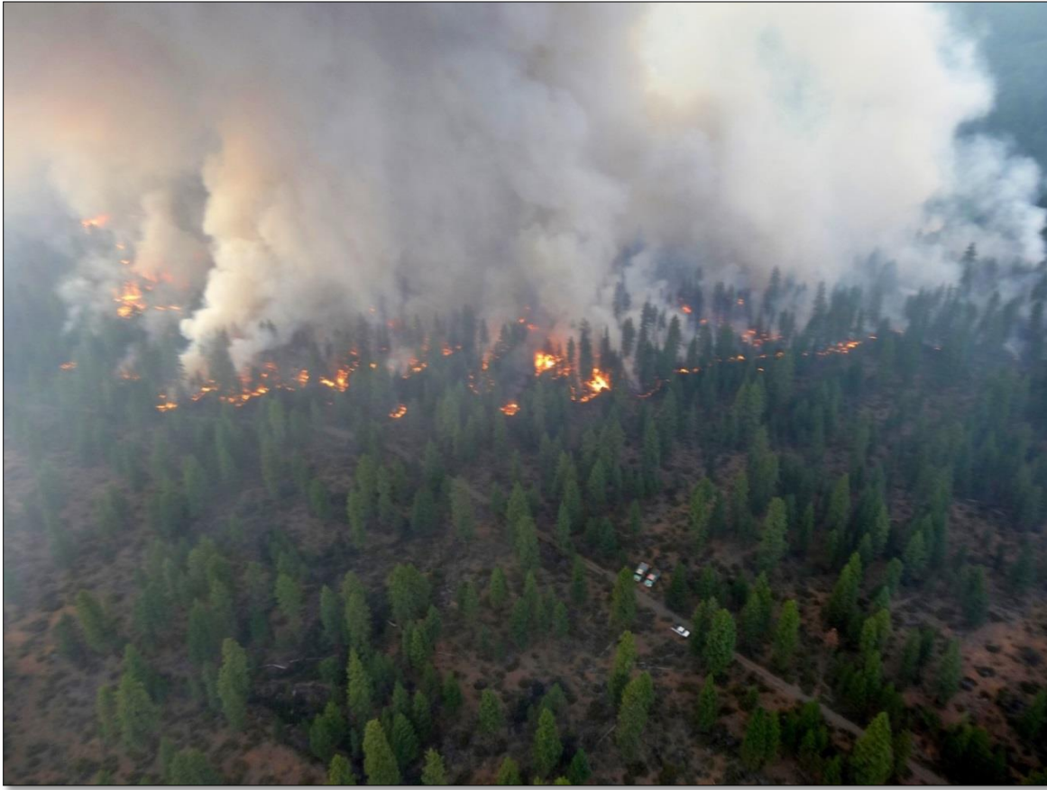
Figure 5: 1936 – Fire pushing the road where the engines and Dave’s truck were parked.