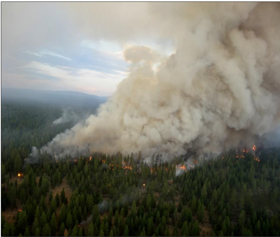
Figure 4: 1935 - Fire spreading to the southwest.

1930 With a bird's eye view from his tower, the lookout reported a second spot fire and torching. Shortly afterward, he radioed in to Dispatch that the direction of smoke dispersal changed. The smoke initially pushed to the northwest now headed south. To the firefighters on the ground, the wind shift manifested in erratic winds from all directions and a fire that began to boil. The pilot, who was returning with the third load of water at 1933, was concerned about the wind change. He tried to contact Frog IC, but Dave did not answer. He sent out an “all call” on air to ground to advise everyone the winds were coming from the east, almost a 90 degree change. He didn't know if anyone heard it, no one acknowledged the call. The fire was very hot, and it was “chewing up the trees.”