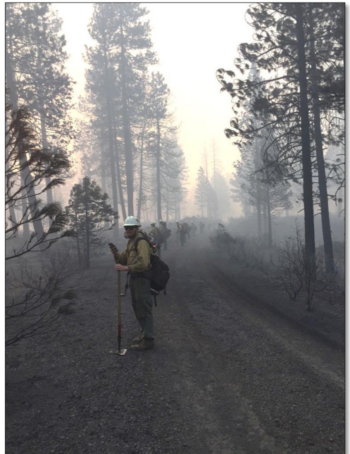
Figure 7: 0733 - Crews lined out to grid through black.

The search for Dave continued the rest of that evening. As difficult as the decision was, Casey informed all the searchers they would call off the search at midnight due to the continued fire behavior, nighttime hazards, snags and potential for serious injury. It was a long night for many people, listening for any sign of hope on the radio while sleeplessly waiting for the sun to come up. The search resumed at 0500 the next morning.