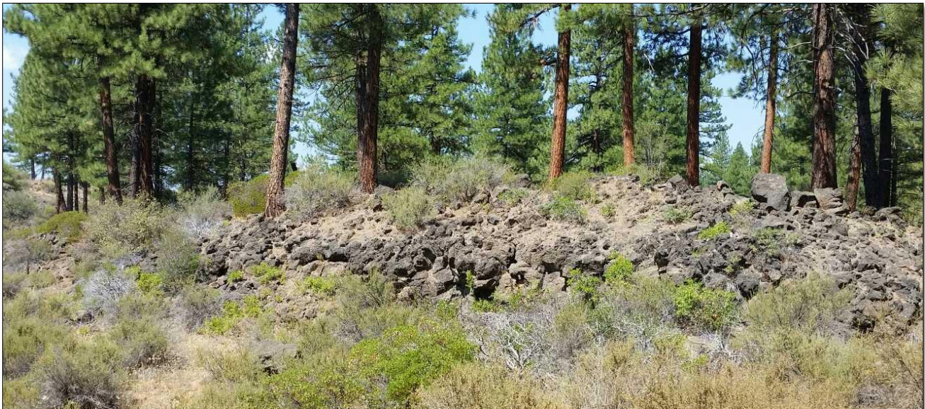
Figure 1: Representative terrain and vegetation conditions.

Outflow from a second storm cell located to the northeast of the fire caused a sudden wind shift to the southwest. This change in wind direction was felt directly on the fire line around 1930. The transition of winds created a powerful head fire running southwest with torching, spotting, and intermittent crown runs with flame lengths calculated between 20 - 80 feet.