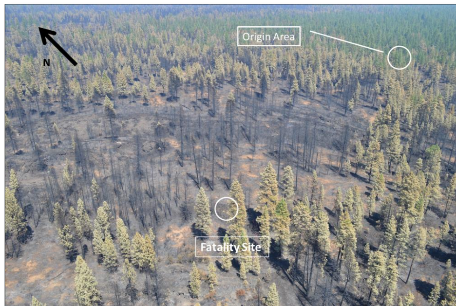
Figure 2: Aerial view of fire origin and fatality site