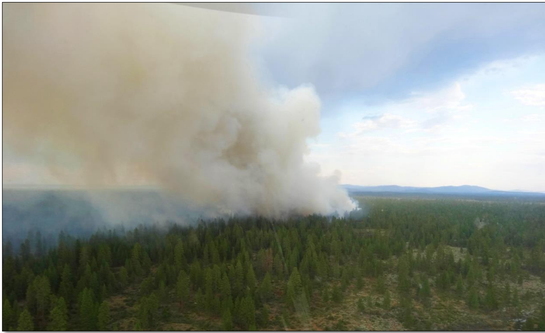
Figure 3: 1903 - Looking south-southeast, fire spreading to the northwest.

When the helicopter had launched at 1811, it couldn't have been a nicer day in Alturas. However, weather conditions in the direction of the fire were different; clouds seemed to be backed up along a ridgeline and clouds and virga were observed to the north and the south of the fire's coordinates. The pilot noticed that the thunder cells were a little unusual; small, light, and transparent, not dark and thick. He changed the flightpath to the south a little to navigate between cells and could see the smoke from about 20 miles out. It was putting up a pretty good plume of dark smoke like it was starting to take off. They received a little rain on the windshield during the rough and bumpy flight in.