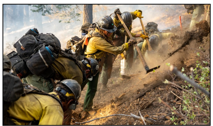
Figure 3: Federal Wildland Firefighters Performing Various Fire Management Activities

or slow them.<sup>14</sup> When not actively fighting fires, firefighters may carry out other activities, such as reducing vegetation to limit the spread of future fires.<sup>15</sup> Figure 3 shows federal wildland firefighters carrying out various fire management activities.