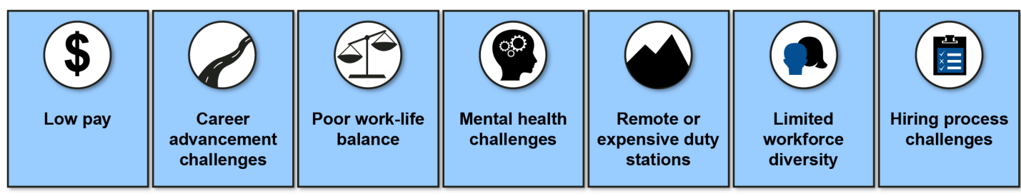
Figure 4: Commonly Cited Barriers to Recruitment and Retention of Federal Wildland Firefighters